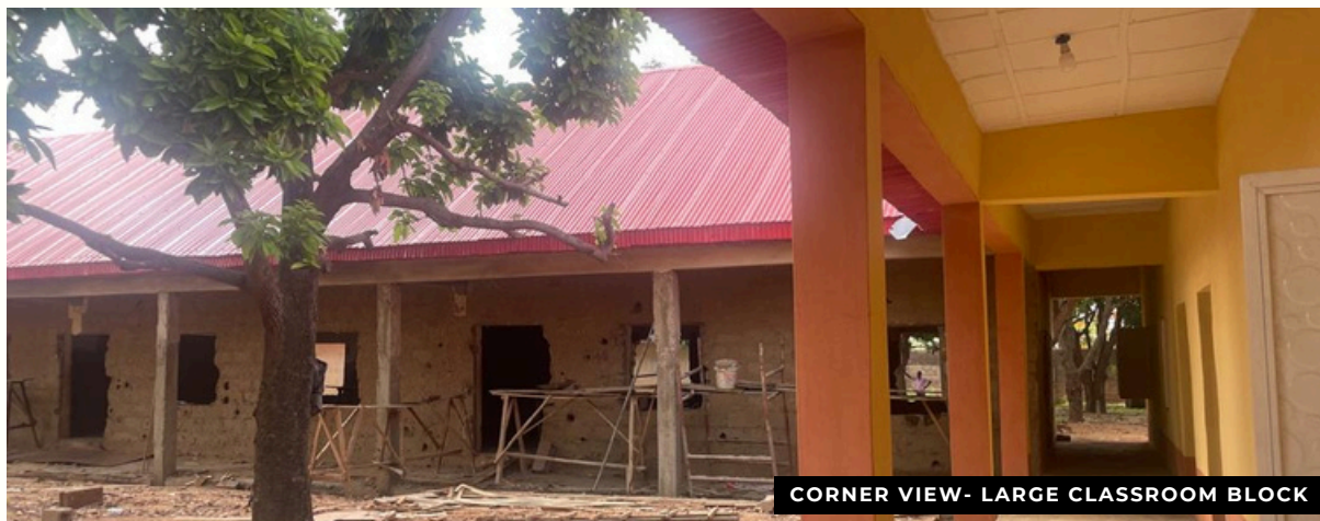
CORNER VIEW - LARGE CLASSROOM BLOCK