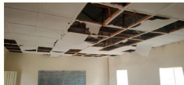
LEFT: KOGUM RIVER CLASSROOM CEILING WITH TERMITE DAMAGE. TERMITES CHOSE TO EAT THE CEILING TILES. NEW MATERIAL HAS BEEN ORDERED THAT TERMITES WILL NOT EAT REPAIRS ARE UNDERWAY.

Kogum River, completely renovated by 2019, has seen extensive termite damage. Currently underway is retreatment of wood supports and the installation of a new termite-resistant ceiling tile material.