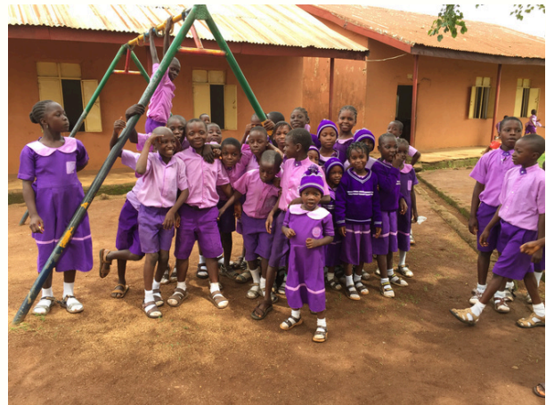
Students respond to their sponsors' letters!