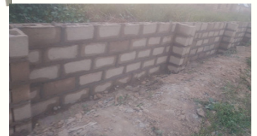
RIGHT: KOGUM RIVER WALL CONSTRUCTION. TREES WERE CLEARED TO MAKE WAY FOR THE FOUNDATION. BLOCKS HAD ALREADY BEEN MOLDED AND WERE MOVED TO THE SITE. FINALLY, GOOD PROGRESS!